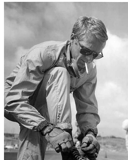
Celebrities from the 1960s

FROM TOP: "The Beatles" 1964, arriving in San Francisco for their concert at the Cow Palace.