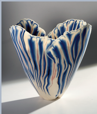
Curtis Benzle, Bowl , ca. 1985. Porcelain, 6.25 x 6.5 in. Crocker Art Museum, Sidney Swidler Collection.